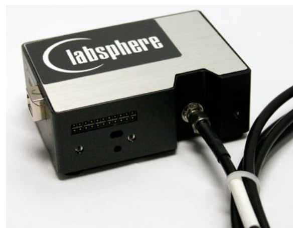
CDS 600 CCD ARRAY SPECTROMETER

The CDS spectrometers easily connect to a PC via an USB-2 port and use a fiber optic cable to connect to the optical head, enabling the remote positioning of the spectrometer. The Windows® XP-based software guides the user through testing procedures making complex spectral measurements simple while still meeting the needs of experienced researchers.